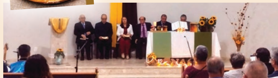
Cover image of the 85th Portuguese-Brazil edition and scenes from the anniversary service